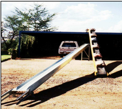
LOADING CEMENT BAGS ON AN UPPER LEVEL

DIFFERENT VARIATIONS AND OPTIONS AVAILABLE WITH THE SIMPLE MODULER DURAB SKID PLATE CONVEYOR: