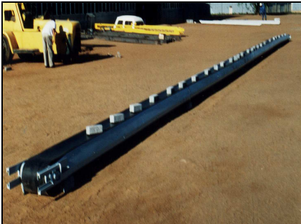
24 METER HORIZONTAL CONVEYOR FOR BRICKS