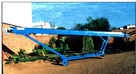
FITTED WITH AN UNDERCARRIAGE, WHEELS AND LIFTING MAST