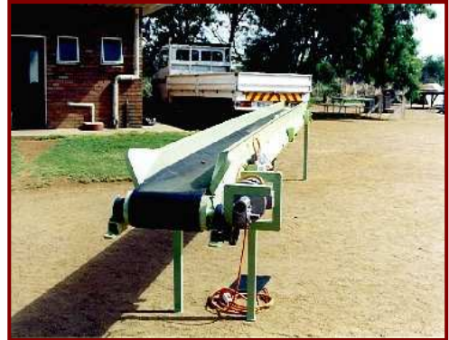
FITTED WITH SIDE SKIRTS AND SUPPORTS WITH SIDE SKIRTS