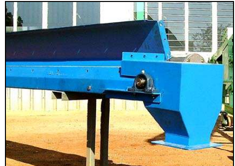
FITTED WITH A DISCHARGE CHUTE