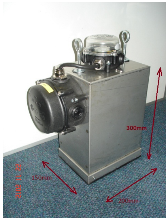
Figure 1 General view with two PRATLEY connection boxes

The measuring instrument is the well-known and proven pDR1000 nephelometric (i.e. photometric) monitor. The instrument is powered by an on-board 9 VDC power supply, which is fed by a 24 VDC supply from a slave PLC. The on-board power supply is equipped with a battery backup providing approximately 12 hours of uninterrupted operation. In normal operation, the instrument is powered by the telemetry slave PLC. In the event of a power supply, interruption the battery backup will maintain supply to the instrument. Real-Time dust readings are transmitted to the Control Centre via the slave PLC.