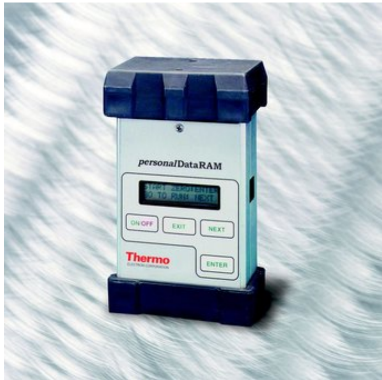
Figure 2 PDR measuring instrument

The instrument enclosure is fitted with a clear Perspex window making the instrument display visible to the user. The instrument can therefore be operated and viewed without removing it from the enclosure. The instrument keypad is accessible from the entrainment opening at the bottom of the enclosure.