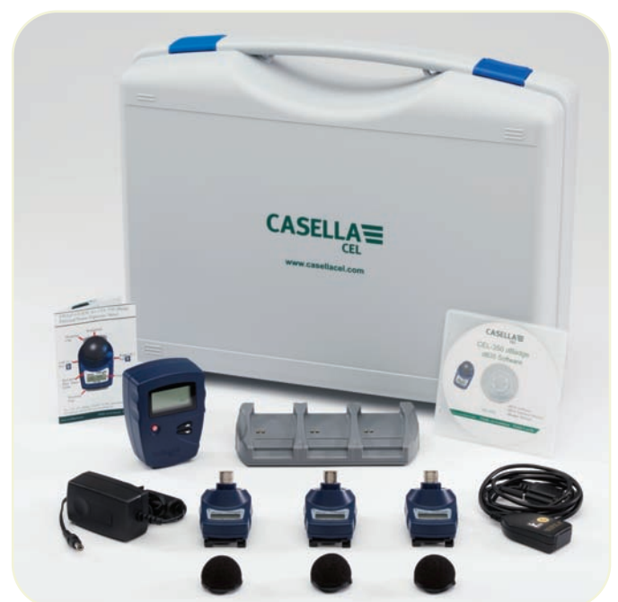
A typical measurement kit

dBadge measurement kits are available with various quantities of dBadges and include all items necessary for workplace noise dosimetry measurements. Each kit is complete with the appropriate number of dBadge units, as well as a CEL-110/2 Acoustic Calibrator, infra-red download cable, 3-way charger, power supply and dB35 software. The CEL-350 dBadges and the CEL-110/2 Acoustic Calibrator are supplied with calibration certificates.