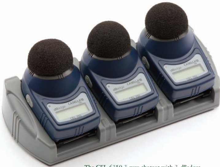
The CEL-6350 3-way charger with 3 dBadge s