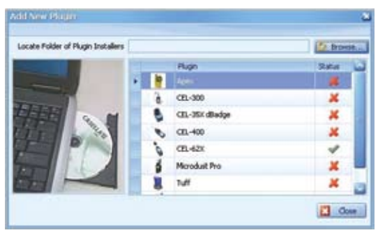
Adding additional instruments

Users of existing Casella software packages can import previously downloaded data. Likewise, data within Casella insight can easily be exported and sent to other colleagues or users, allowing data to easily be shared across organisations.