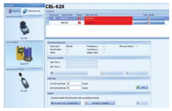
Instrument calibration and configuration screen