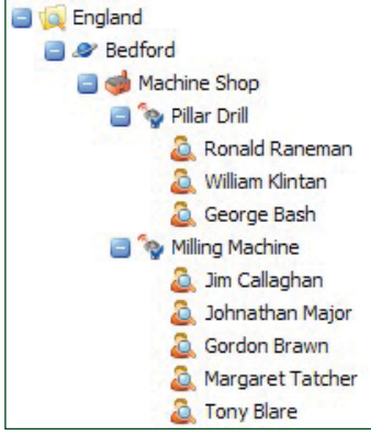
Data can be stored and organised using a Tree View

The integral report wizard allows reported parameters to be selected as required and report settings are retained for the next time it is used. Notes can be added to data, which appear on reports as required. This information could include details about the measurement and subsequent recommendations or actions required to reduce exposure.