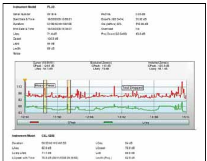
An example of a run report